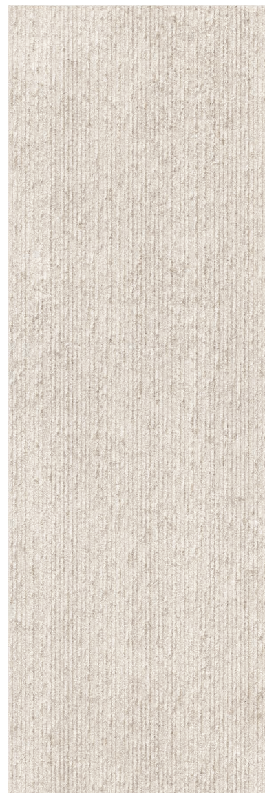
PEARL Slot Deco Matte