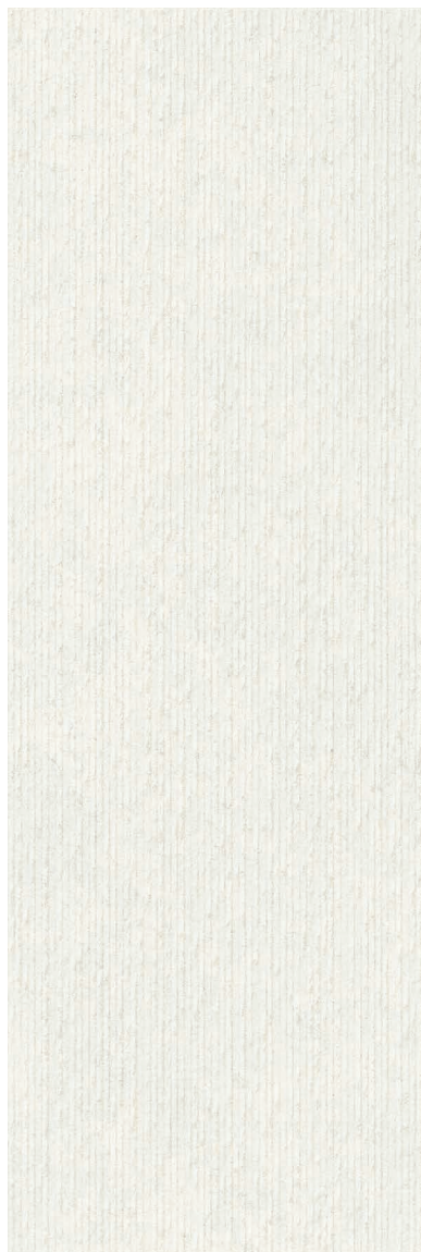
SNOW Slot Deco Matte