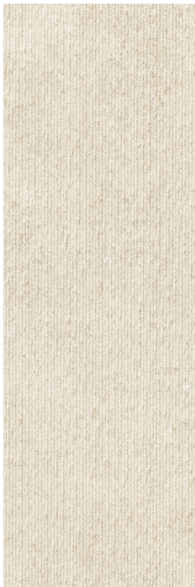
BONE Slot Deco Matte