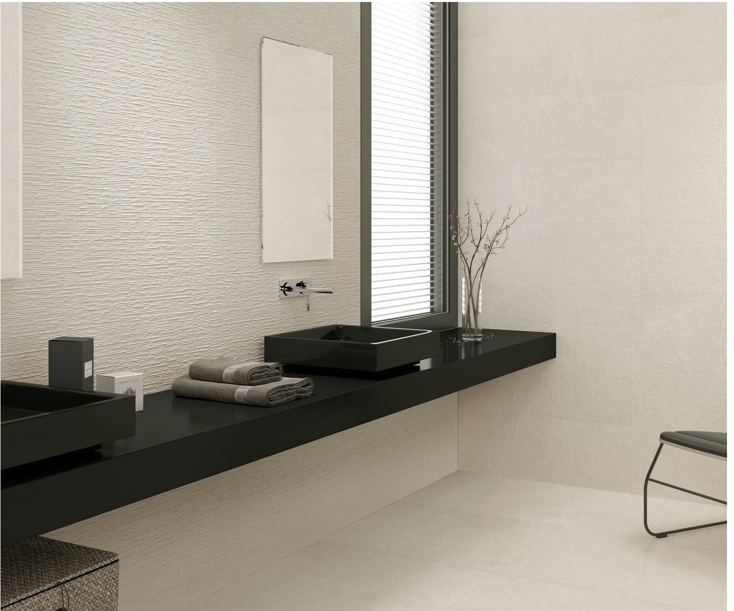
Bone Slot Deco Matte (Wall - left side only)